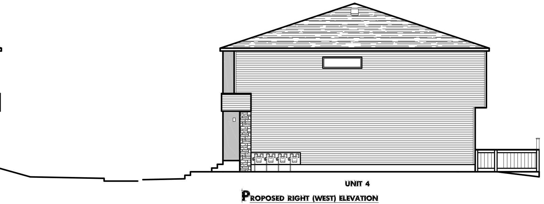
PROPOSED RIGHT (WEST) ELEVATION