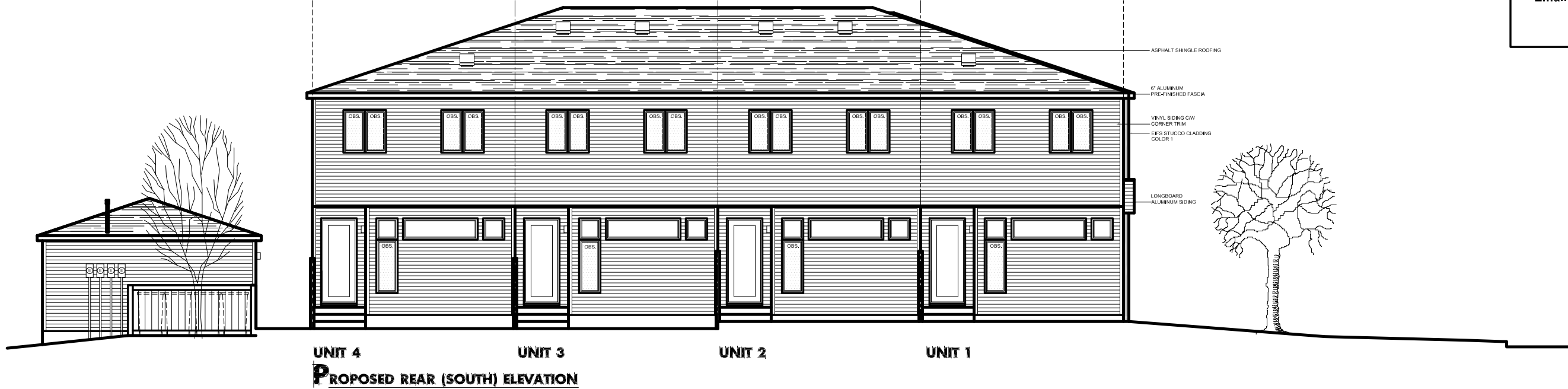
PROPOSED REAR (SOUTH) ELEVATION