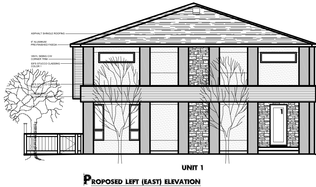
PROPOSED LEFT (EAST) ELEVATION